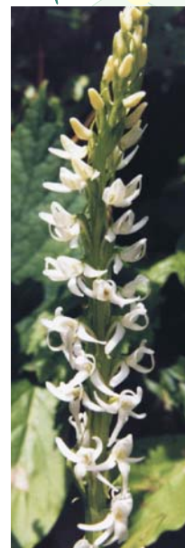
White Bog Orchid

Size: 1/2 to 3 feet tall; flowers 1/2 inch wide